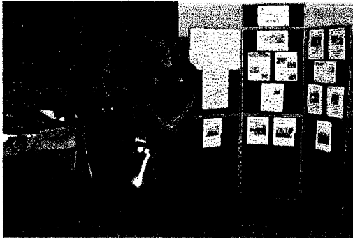
Responders at Woolpit Steam Fair

So far this year we have attended 98 calls - mainly for chest pains, strokes, diabetic issues and falls. As well as the four main villages in our name, we also cover seven other nearby villages.