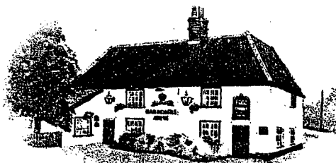
The Gardeners Arms

The Gardeners Arms, is pleased to announce that the local band 'Franks Tanks' is appearing at The Gardeners' on Saturday 23 rd August. (Further bands and dates to be announced!)